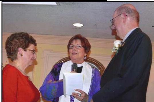
Blessing of the Marriage