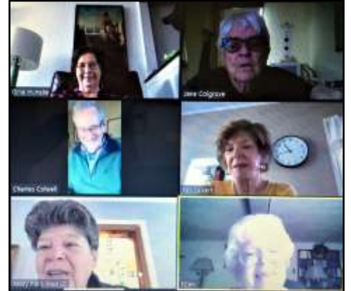
Wed Coffee Hour