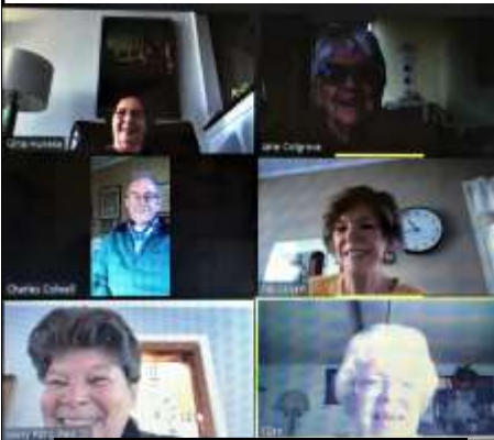
Wed Coffee Hour