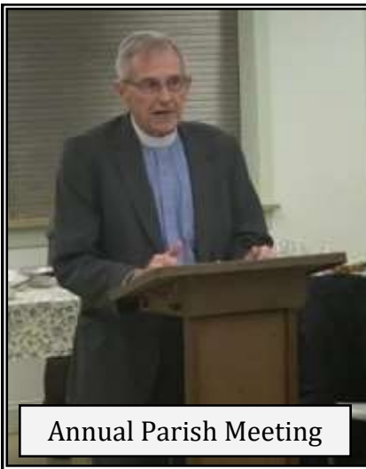
Annual Parish Meeting